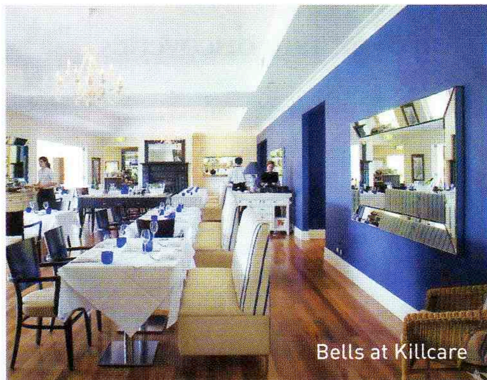
Bells at Killcare

The new Oxfam Shop in Doncaster Shopping Centre stocks fairtrade products for foodies, including coffee, tea, chocolate and spices. Ground floor, 619 Doncaster Rd, Doncaster, oxfamshop.org.au .